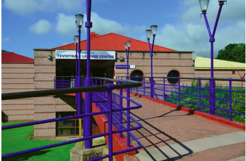
Trial of RAPID BOIL™ Energy Saving Treatment at Teviotdale Leisure Centre